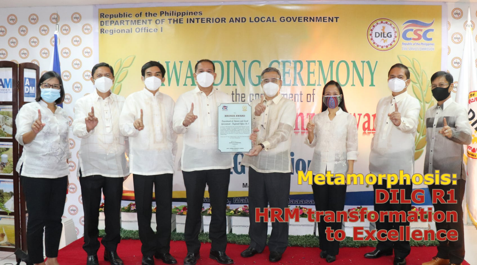
Metamorphosis: DILG R1 HRM transformation to Excellence