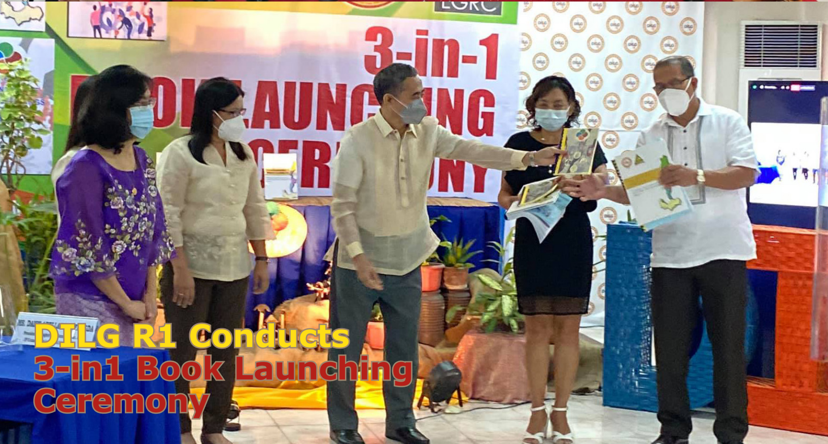
DILG R1 Conducts 3-in1 Book Launching Ceremony